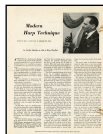
Article about Modern Harp technique written by Carlos Salzedo.