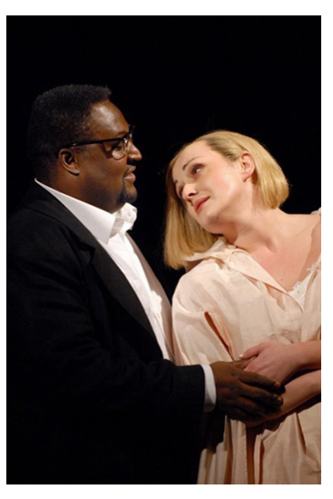
Six hundred sixty-fourth program of the 2023–2024 season Photography and videography are prohibited