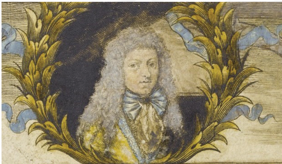
Johann Kuhnau (1660–1722) from the cover of his Neue Clavier-Übung, erster Theil (1689)

Three hundred fifth program of the 2022–2023 season Photography and videography are prohibited