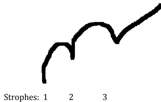
Figure 1. Graphical representation of Liszt's progression to climax in "Frühlingssehnsucht."

To work within this model Liszt must have miniature climaxes as he journeys towards his goal. Movement to the minor where the major had already been presented represents retrogression rather than progression if the ultimate goal is to evoke victory or peace. Schubert's insertion of the unexpected minor mode in an unexpected key interferes with Liszt's teleological process and is thus modified in the transcription.