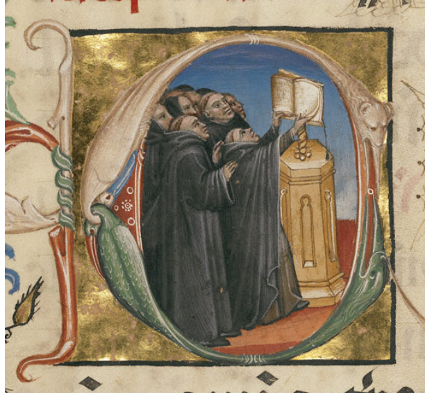
Initial C: Monks Singing. Unknown artist, Italian, circa 1420. MS. 24, f. 151.