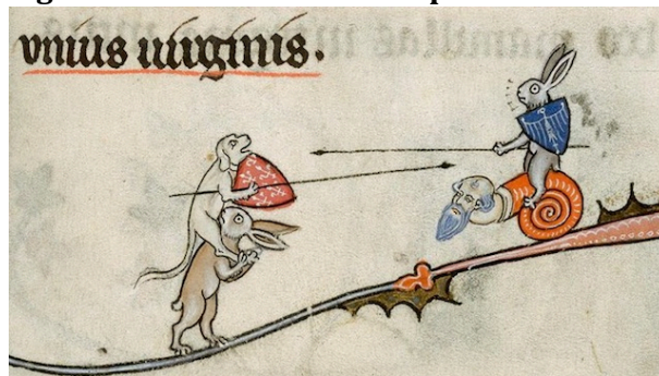
Figure 4. Humor in manuscripts

Perhaps part of the reason Philomathes's treatise was more widely printed than other similar treatises was Philomathes's focus on animals. Medieval and Renaissance scholars appreciated a good laugh and engaged in mischievous and playful depictions within manuscripts. The fact that manuscripts are often full of dueling rabbits, knights fighting snails, and other bizarre illustrations shows that books were not exclusively in the realm of serious study. Philomathes maintained a connection to the parochial matters, which a wider, more rural readership might have appreciated greatly.